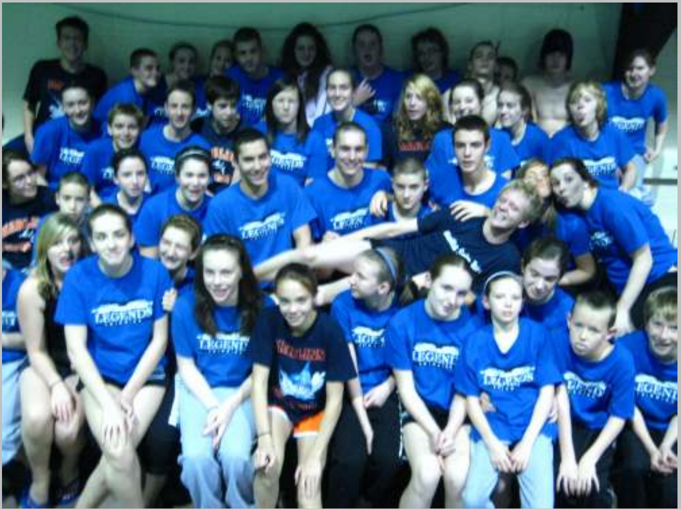
Newfoundland's Legends and Marlins at the meet.